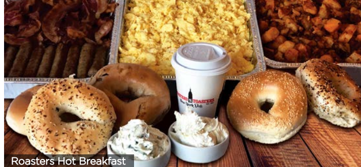
Roasters Hot Breakfast

Fresh Cut Fruit Salad 5.99 Oatmeal | Plain or Cinnamon Raisin 6.99 Fresh Squeezed Orange Juice | 16oz. 5.29 Fresh Squeezed Lemonade | 16oz. 5.29