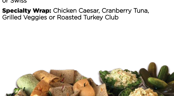
Roasters Sandwich Platter

Specialty Wrap: Chicken Caesar, Cranberry Tuna, Grilled Veggies or Roasted Turkey Club