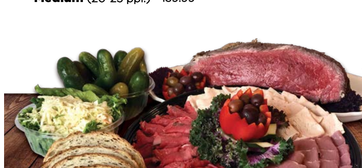
Deli Meat Platter

Small (10-12 ppl.) 69.99 Medium (15-20 ppl.) 94.99 Large (25-30ppl.) 124.99