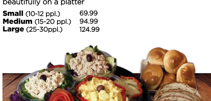
Deli Salad Platter