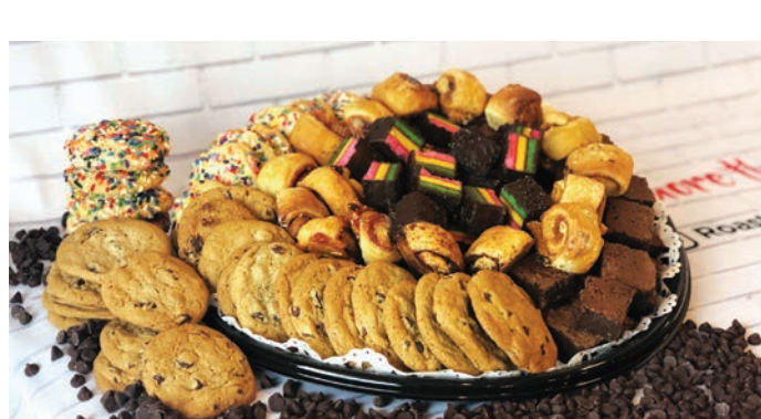
Freshly Baked Sweet Platter